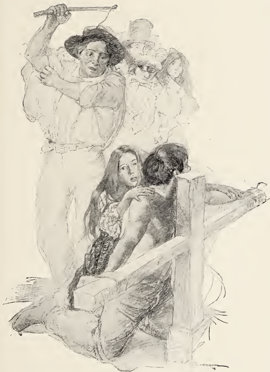
She flung herself in front of Mac Dougall.— Page 110